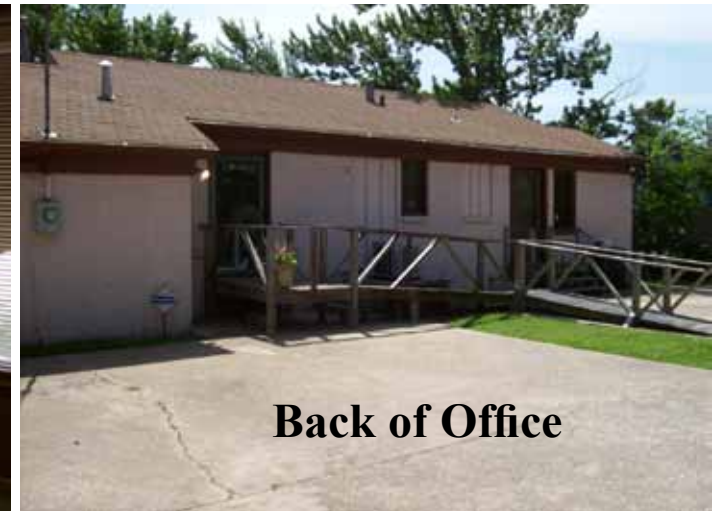
Back of Office