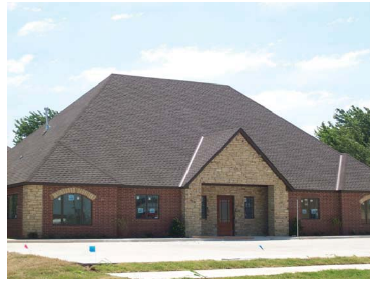
One of our completed Hidden Forest office buildings