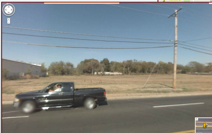
2.2 Acres parcel roadside view