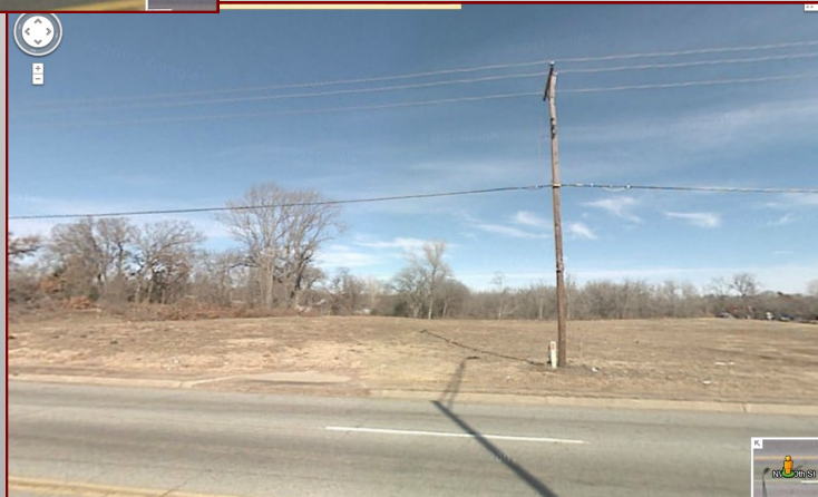
10.0 Acres parcel roadside view